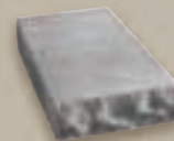
Cap unit (Front, 3" x 13" x 7" Back, 3" x 13" x 8")