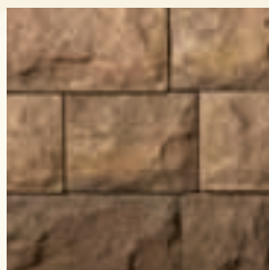
Sunset Brown (No. CA, So. CA)

Belgard's retaining wall collections combine the textures and rich color blends of natural stone with the structural integrity and consistent quality that our customers have come to expect.