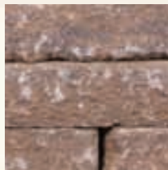
Toscana Blend (No. CA, So. CA)