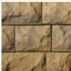
Santa Barbara (No. CA, So. CA)